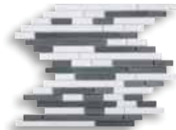
Strip Mix Glacier Nieve Porcelánico 29.8x30.4 cm L241701061 | 100059787 G-177