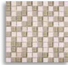
Mix Crema Italia Glacier Crema Brillo-Mate 2x2 cm 29.8x29.8 cm L108003741 | 100066580 G-181