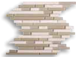
Strip Mix Crema Glacier Crema 29.8x30.4 cm L108003711 | 100059781 G-181