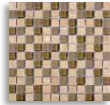
Mix Travertino Glacier Tobacco Brillo-Mate 2x2 cm 29.8x29.8 cm L108003721 | 100066581 G-181