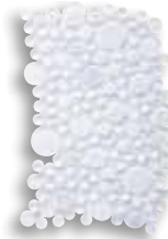
Moon Glacier Metallic White 20x30x1 cm L240900021 | 100062571 G-186