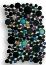
Moon Glacier Metallic Black 20x30x1 cm L108004611 | 100062508 G-192