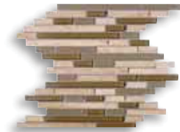
Strip Mix Travertino Glacier Tobacco 29.8x30.4 cm L108003731 | 100059786 G-187